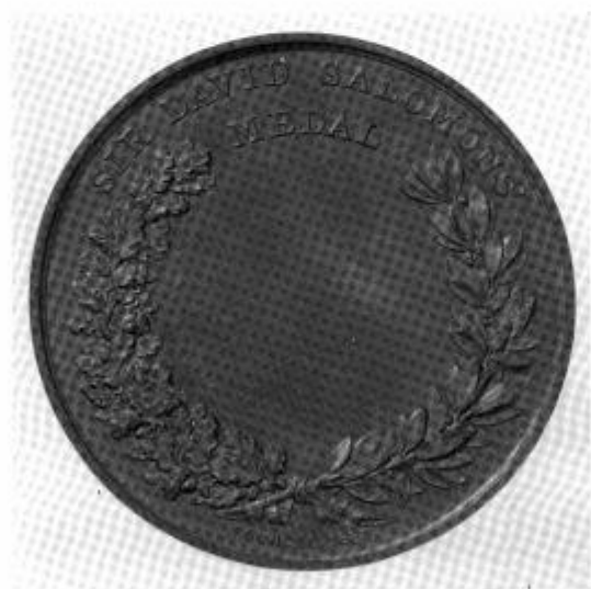
PLATE VI Sir David Lionel Salomons' Medal