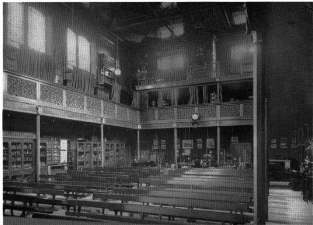
PLATE VIII The Science Theatre, Broomhill. Photograph taken about 1910